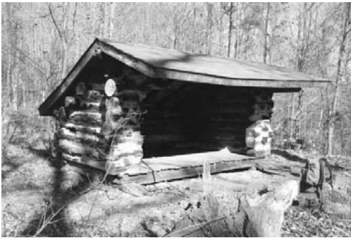
Shelter on the Baker Trail

The Baker Trail is a primitive footpath with backpacking facilities extending 141-miles from its start near Freeport, PA to the Allegheny National Forest near Muzette, PA where it connects with the North Country Trail. It was conceived in the