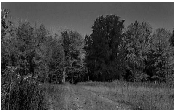
Autumn on the Baker Trail

In Pine Township the Blue Heron Ridge plan of homes is designed on land of the former Beyer and Mogielski farms along Route 910. It has a wooded hillside that is viewed from Brooktree Center which will remain mostly undisturbed as its open space. Trails are planned that will reach to the valley and connect to the trolley corridor. A half mile right-of-way from Route 910 will be dedicated to the Harmony Trail and reaches to other valley land of the trails group donated by partners at Brooktree.