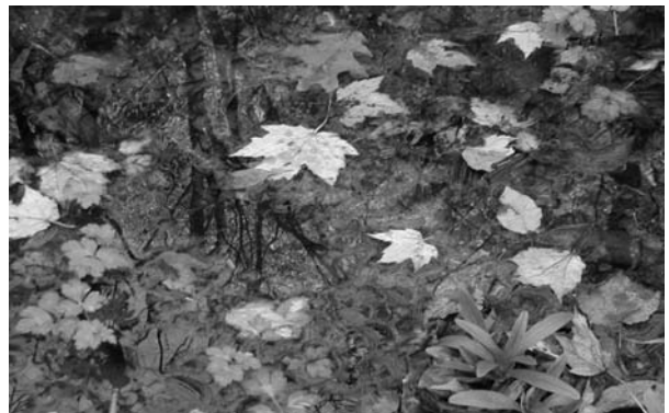
Reflections along the Harmony Corridor

The design for a trail from Route 19 (opposite Brooktree) starts at the base of Brooker Drive, and joins an old lane that leads to the soccer fields on McKinney Road. The plan has been submitted to Allegheny County. Approval and construction help by the County is expected this year.