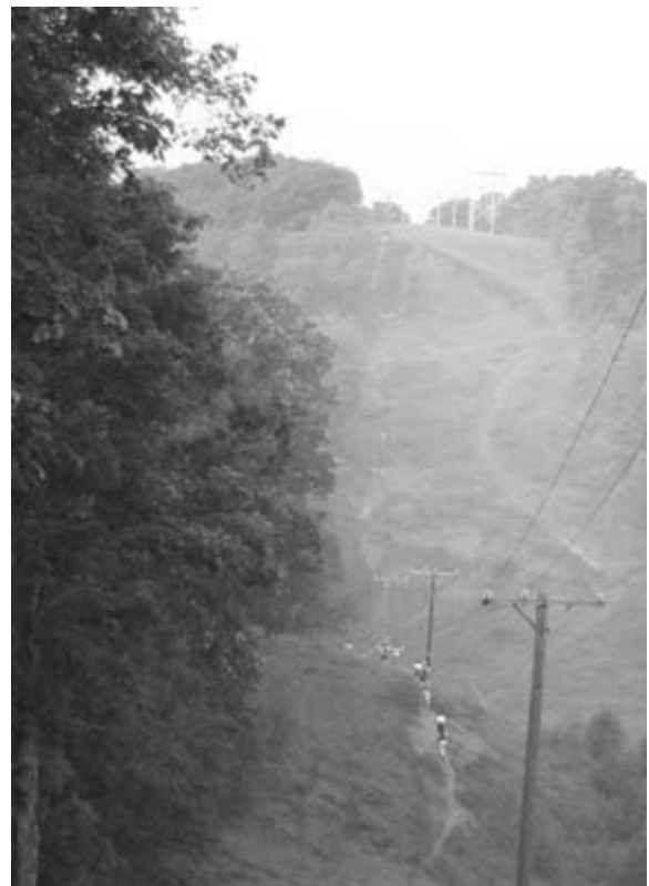
The Challenge

in April. If you're interested in participating in or volunteering for the Challenge, be sure to attend the May 11th meeting (see the Event Calendar in this issue). Visit the trail web site www.rachelcarsontrail.com to register or for more information.